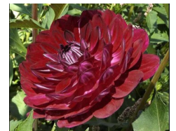
Sandia Bertha Federation Dahlia of the Year, 2026