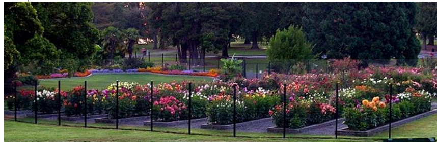
Pacific Northwest Trial Garden Point Defiance Park, Tacoma

There is still space in the Pacific NW Trial Garden in Tacoma for the 2025 season. Let Terry know the number of varieties you would like to enter in the trial garden for 2025.