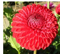
Skipley TNT Ball Federation Dahlia of the Year, 2025